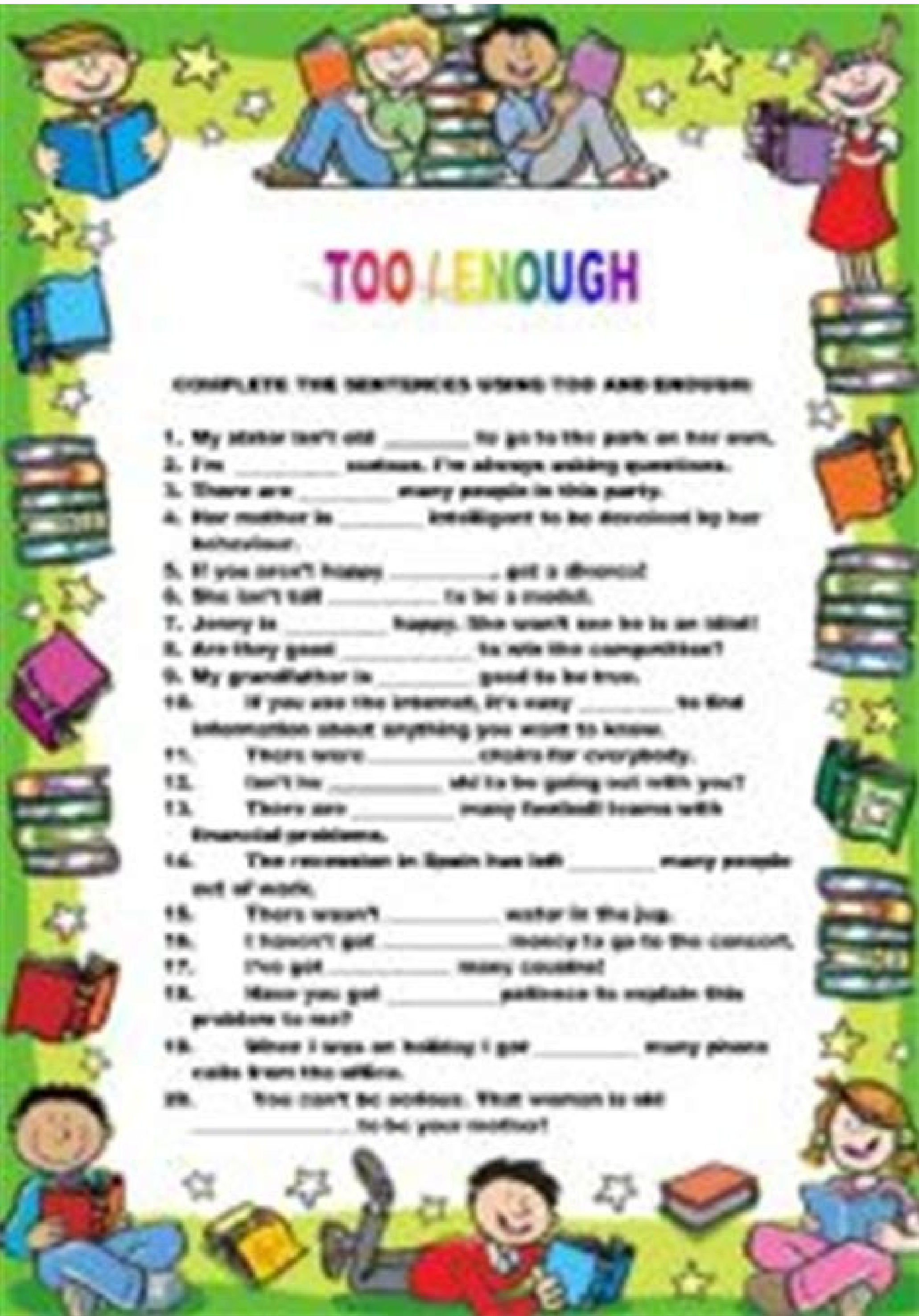
Too and enough esl worksheet.